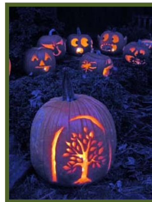
Results of the 2011 CSWR pumpkin carving

In October they turned out for our annual pumpkin carving, the oldest continuing tradition of CSWR. Feel free to visit our Facebook page for some great photos of this event.