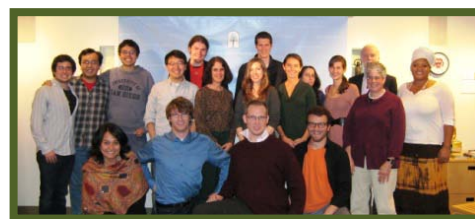
CSWR's 2011-2012 residents