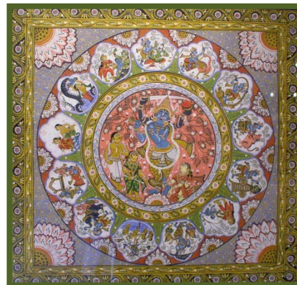
Mandala with 13 scenes from the life of Krishna, by an anonymous Indian folk artist

Other needs include funds to support visiting scholars, and to underwrite the rather expensive renovation of our third floor space (and access to it) so that it can once more be a Meditation Room, a flexible multi-use space for lectures, colloquia, or a gathering place for CSWR residents.