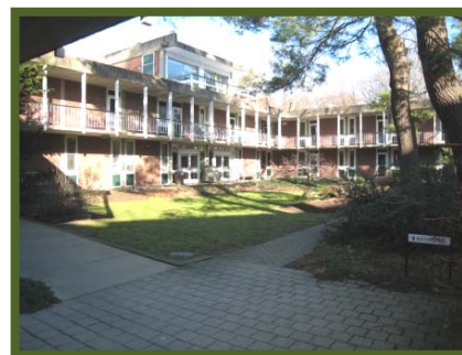
Late fall in the CSWR courtyard